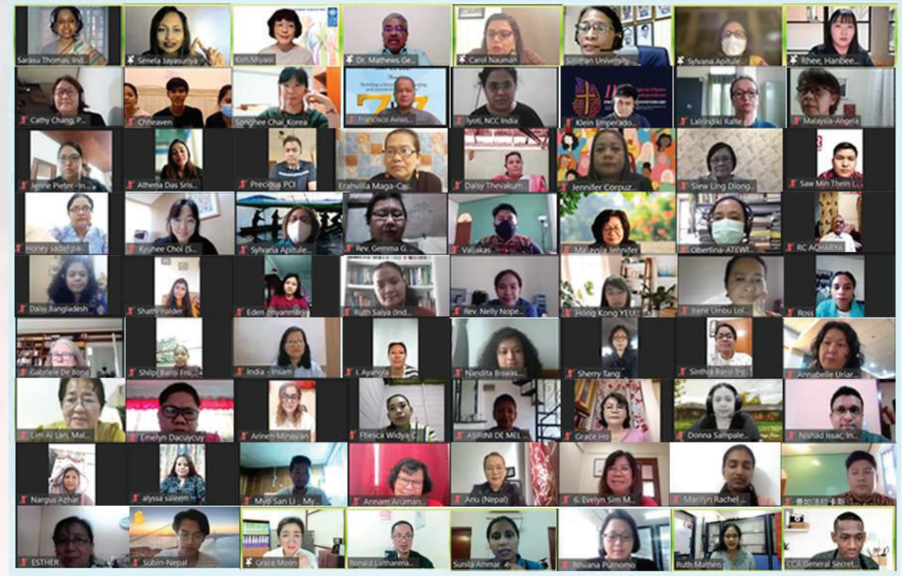
Regional Consultation on 'Ensure Gender Equality; Empower Women and Lift Up Humanity' 8–9 July 2021