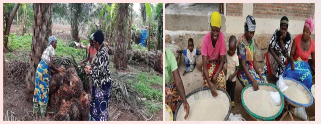
Projects for widows in oil making (left) & rice processing for sale (right) in Burundi, 2020

(d) Consultation on The Role of Men in Enhancing Gender Justice In Africa - July 28, 2020 The department organized a 2 hours Zoom Consultation on the "Role of Men in Enhancing Gender Justice in Africa. The meeting held on July 28, 2020 brought about 33 male participants from across the continent. The keynote speaker highlighted the issues and the significant role of men in addressing issue of gender justice. In addition, there were regional presentations and recommendations. The main objective was to mobilize and engage men in a Consultation to accelerate actions against all forms of gender injustice and domestic violence during and beyond the pandemic.